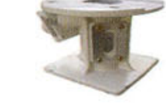
Standard Hopper Dryer Base